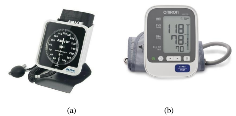
Figure 2. Sphygmomanometer (a) Non Automatic, (b) Automatic