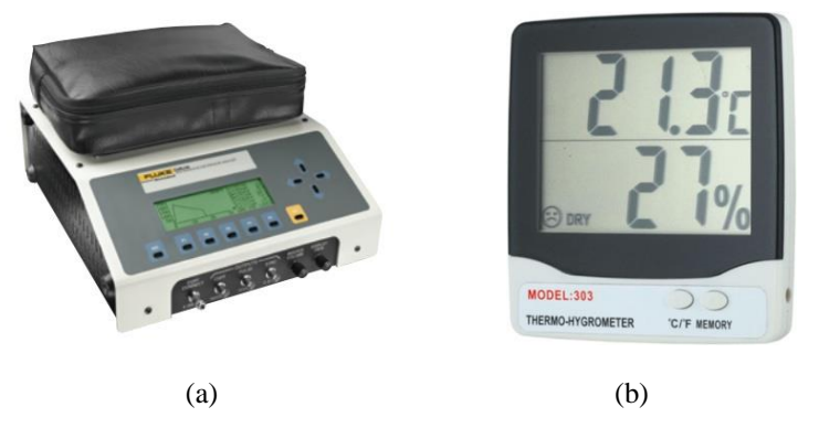
Figure1. Calibration Measuring Instrument (a) NIBP Analyzer, (b) Thermohygrometer

In pre-research stage, the author conducted literature study about state of the art from research on sphygmomanometer calibration. Then, a review of calibration method was carried out. The calibration method used in this study was working method of the Ministry of Health in 2018 [30]. Working method reviewed was studied in detail and reduced into several documents needed during the research. These documents were work instructions, worksheets, and data processing techniques created on google spreadsheets to calculate the value of the measurement uncertainty. Documents which had been made were validated by the quality team of PT NIQ Teknik Indonesia. After did the validation process, the next step was preparation of measurement tools and sphygmomanometer tools to be tested.