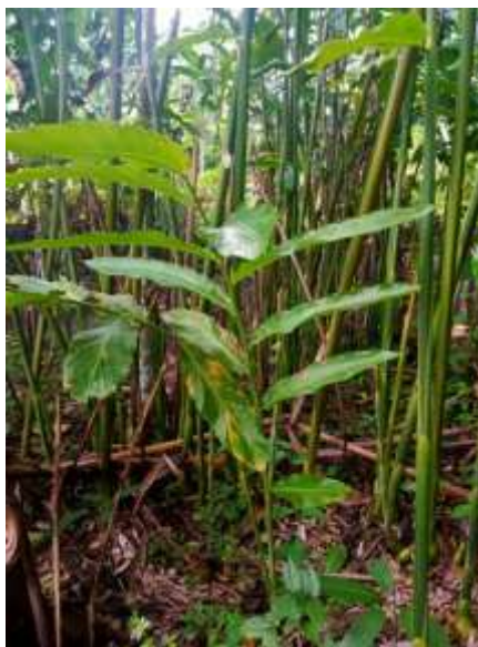
Figure 1. Torch ginger ( Etilingera elatior )

Torch ginger is native to Indonesia as evidenced by ethnobotany studies on the island of Borneo, where 70% of the species have other local names on the island. Torch ginger is included in the zingiberaceae family, this plant is known by various names including "kencong" or "kincung" in North Sumatra, "kecombrang" in Java, "honje" in Sunda, "bongkot" in Bali, "sambuung" in West Sumatra and "Kantan flower" in Malaysia. Western people call this plant a torch ginger or torch lily because of its torch-like flower shape and stunning red color. Some people also call it the Philippine waxflower or porcelain rose in reference to the beauty of its flowers [5].