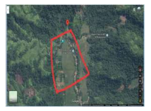
Figure 1. Setara Nanggalo Area

Anuran's habitat diversity makes research on feed very important as an indicator to see the ecological function of Anuran's presence in this habitat. Kenagarian Setara Nanggalo, Pesisir Selatan District is a village with extensive agricultural activities. In the agricultural area of this village, several Anuran species are found, including Fejervarya cancrivora and Fejervarya limnocharis . which are two species of the order Anuran that are closely related and live in the same or sympathetic place in the region. Based on the description above, a study was conducted under the title Natural Feed Preference Fejervarya cancrivora L. and Fejervarya limnocharis L. on the West Coast of Sumatra Island which aims to determine the relationship between Natural Feed Preference Fejervarya limnocharis L.